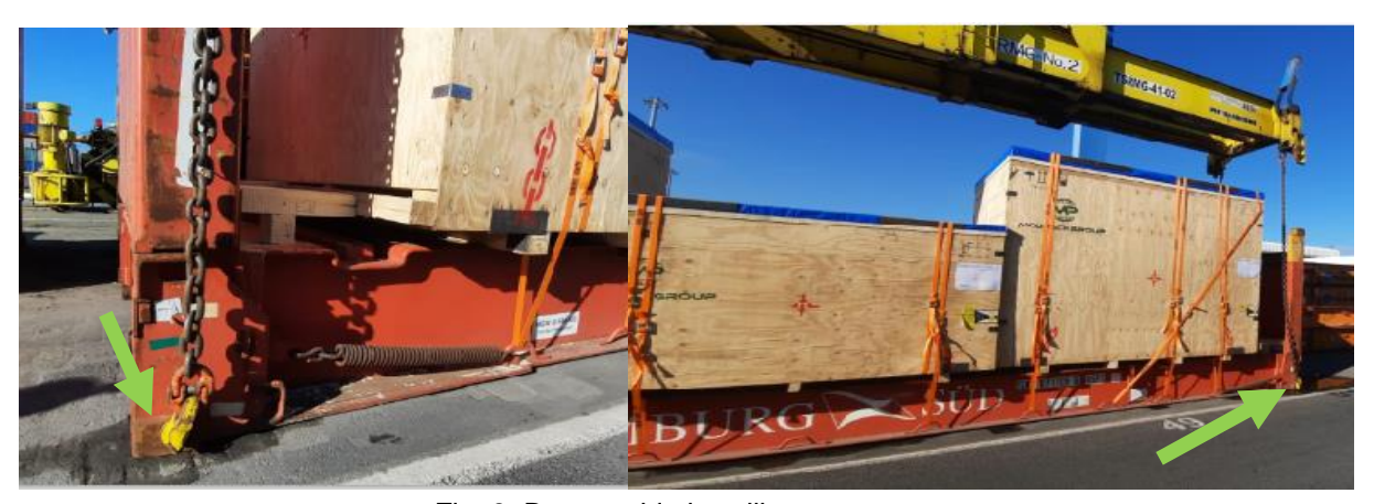
Fig. 3 Bottom side handling