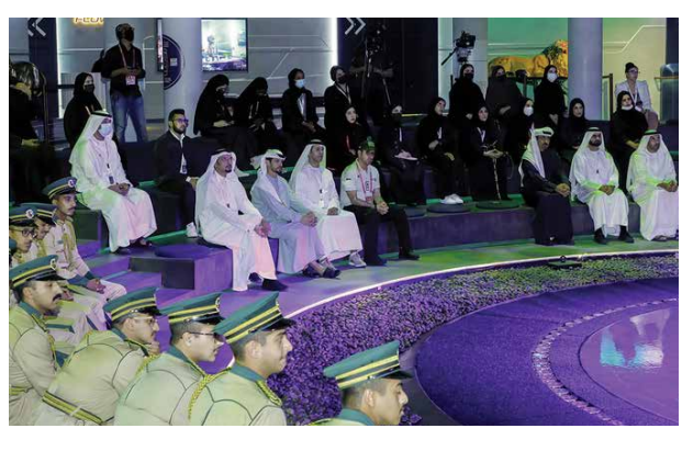
12. Oct 31st, 2021 – Fourth week at Expo 2020, DP World Flow Pavilion welcomed visitors from Dubai Police HQ, as well as government delegations from Egypt to the Maldives.