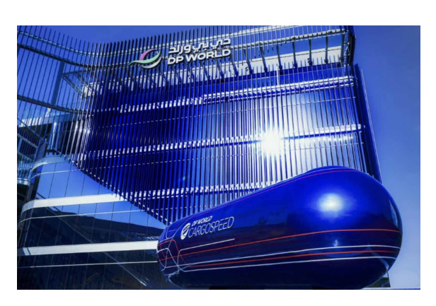
1. Oct 1st, 2021 – Launch of DP World Flow Pavilion at Expo 2020 Dubai.