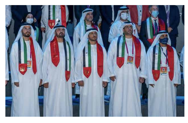
14. Nov 3rd, 2021 – Special ceremony organised at the DP World Flow Pavilion to celebrate UAE Flag Day with visitors.