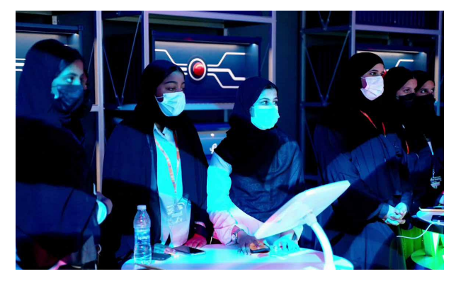
11. Oct 24th, 2021 – Third week at Expo 202 Dubai, DP World hosted government delegations from no less than eight countries, welcomed students from across the UAE to the DP World Flow Pavilion, and even had world-famous artist Akon join us for a tour.