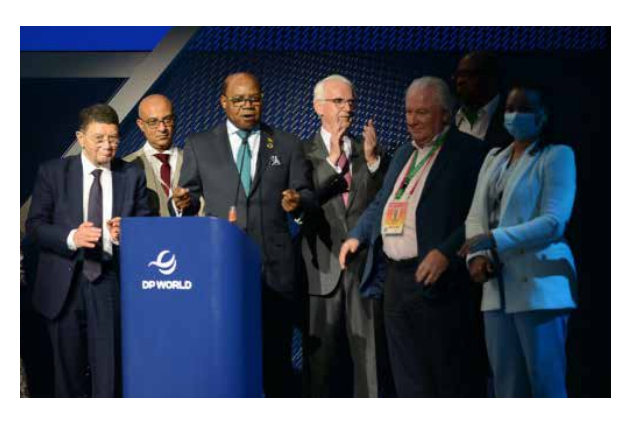
29. Feb 22nd, 2022 – Hosted the Global Tourism Resilience Forum with Tourism Resilience, on enabling the recovery of the global tourism Industry and sustainability