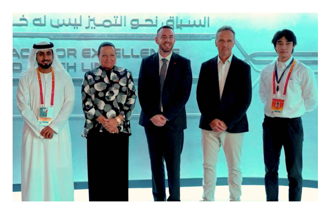
27. Week 18 – DP World welcomed the Commissioner General of Canada to our Flow Pavilion.