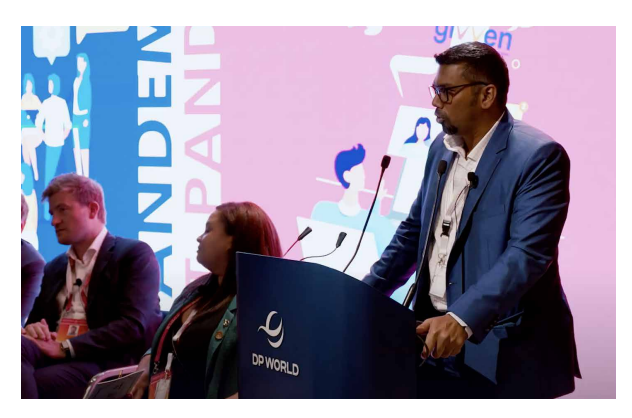
31. March 15th, 2022 - The Digital Freight Alliance held its first-ever in-person conference at DP World's Flow Pavilion