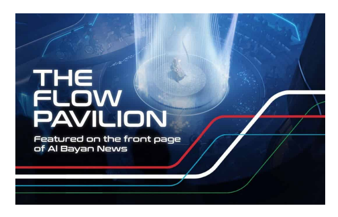
13. Nov 2nd, 2021 - DP World's Flow Pavilion featured as a masterpiece in the front page of the Expo 2020 Dubai article published by Albaya News.